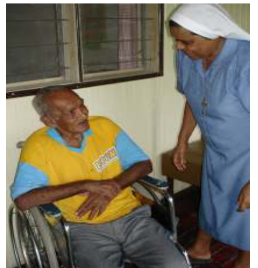
Care of the Elderly at the new Law Home in Fiji Supported by Marist Mission Center