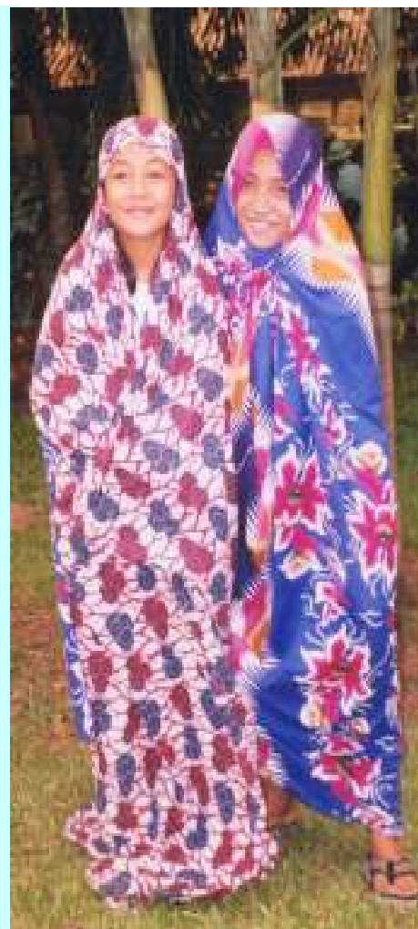
Smiles of Children often conceal little broken hearts and smashed dreams.