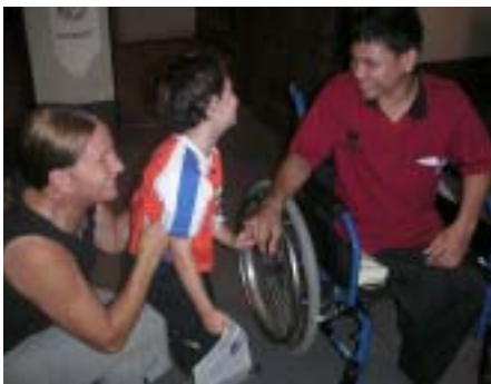
Above: 'With the friendly folk of Mary Immaculate.' Below: 'The folly of an arm wrestle with Ban... a formidable opponent'.