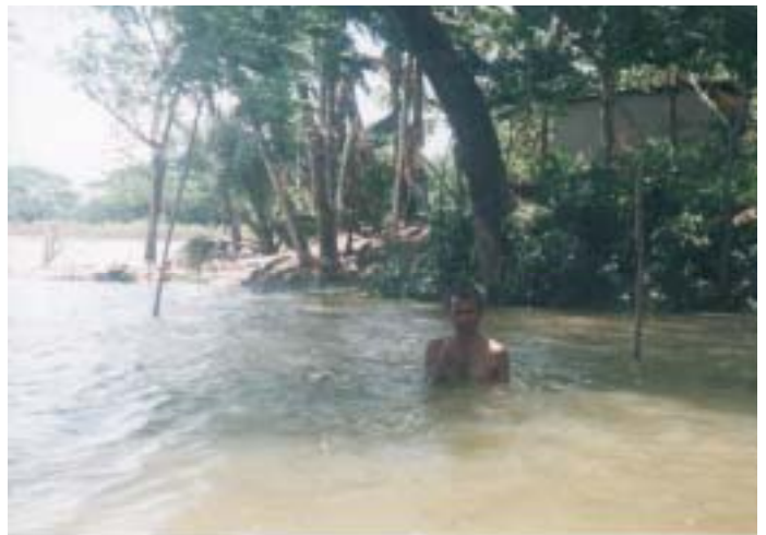
Top: The lads of Bon Bosco Students' Home, Dhaka, were amongst the first to volunteer for flood relief activities. Many of these young men have themselves experienced the trauma which seasonal rains so often produce in their nation. Above: This man stands in shoulder-deep water outside his home on the outskirts of Dhaka. Millions of people throughout Bangladesh were rendered homeless overnight in the disastrous downpours. Left: HDP workers at an emergency relief centre in Dhaka.