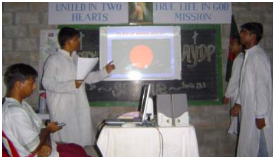
Above and upper right: Presentations from each national group of AYDP-ers give insights into culture and differences and lay a base for formation of an international network of young leaders and managers.

being completed as we join the eight refugee youngsters from Karen and Karenni States.