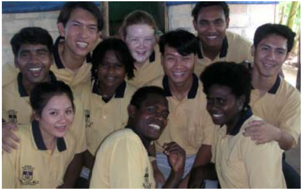
Above: The many colours of AYDP: young people from Australia, Bangladesh, Cambodia, Karen State, Karenni State, Thailand, mainland PNG and Bougainville. A total of twenty participated at Maesot, Thailand.

as enthusiastic as ever in showing us the work of the Good Shepherd Sisters with the underprivileged women, girls and children of Thailand.