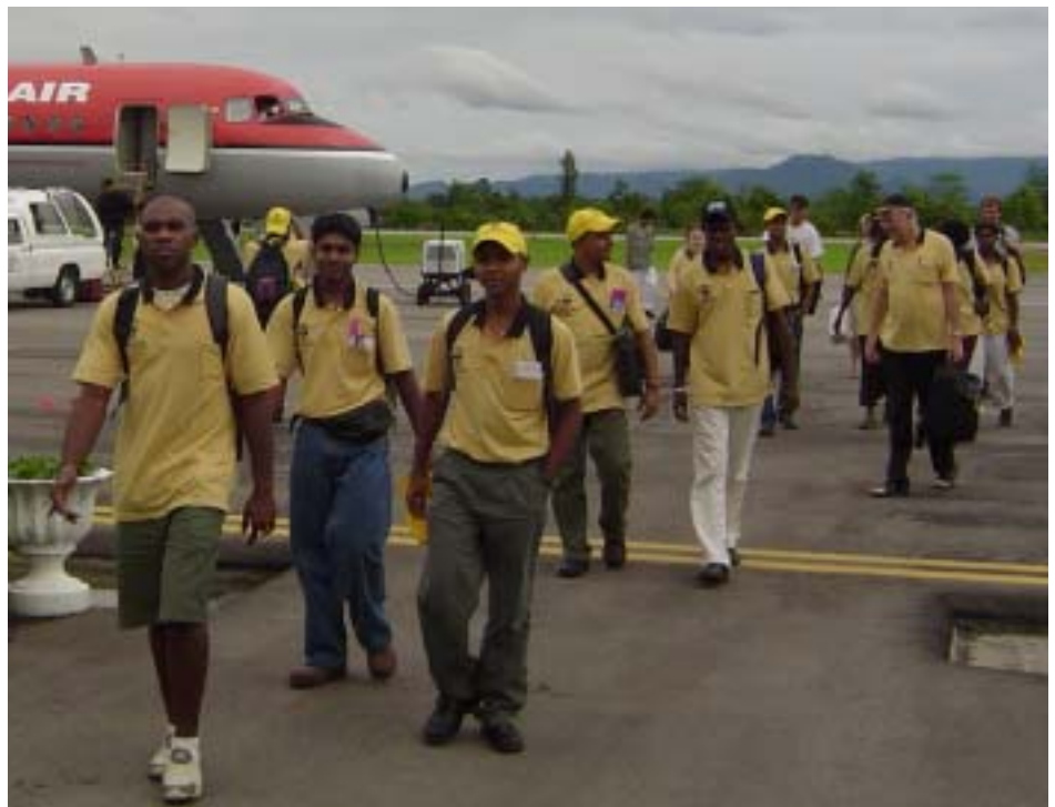
Left: AYDP-ers relax between days of leadership and management sessions. Lower left: ‘Coping with distractions’, an after-lunch session. Above: AYDP-ers from six nations arrive at Maesot on the Thai-Burma border. Right: PNG youth entertain at Maesot’s famous ‘Crocodile Tear’ restaurant.