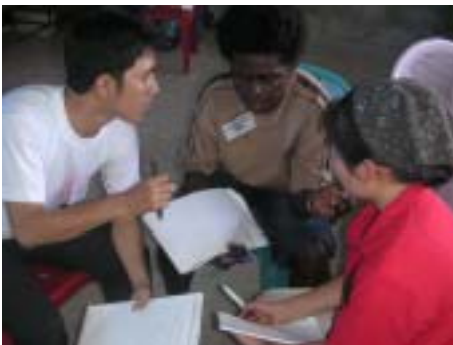
Above and below: AYDP's adult learning process include quiet, personal reflection with sharings in small groups and with all twenty participants.