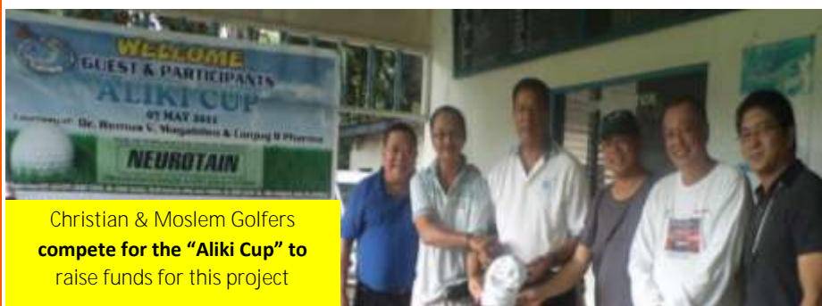
Christian & Moslem Golfers compete for the "Alik Cup" to raise funds for this project