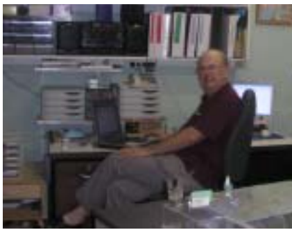
Above: 'I am blessed to have a well-appointed office'

A 'mini-TOH' experience brings new insights to two youthful missionaries.